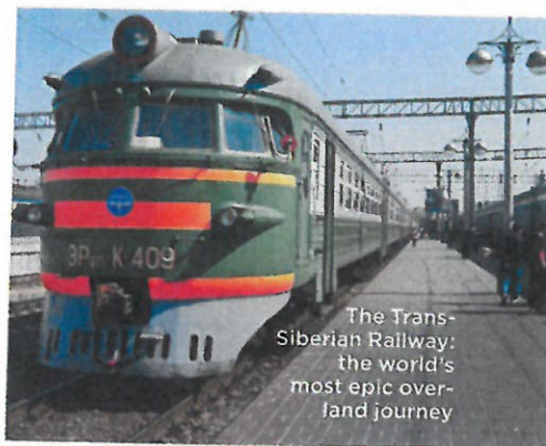
The Trans-Siberian Railway: the world's most epic over-land journey