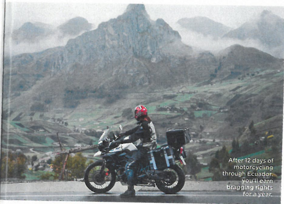
After 12 days of motorcycling through Ecuador, you'll earn bragging rights for a year.

It's the world's longest railroad and a journey that takes in everything from the Siberian forest to the unbroken steppes of Mongolia. Trans-Siberian Travel will book all your tickets — the journey from Moscow to Beijing is a series of rides rather than a continuous one — and will set you up with B&B-like homestays when you're not sleeping on the train. By day, watch the taiga float past your window. At night you can explore cities such as Irkutsk, where artists and intellectuals banished during the Decembrist revolt set up a booming cultural center around their hand-carved wooden houses. Just make sure to set aside three days for hiking along the shores of Lake Baikal, the world's deepest lake. THE DETAILS: 17-day tours from Moscow to Beijing, from $2,160. Summer is the time to go. trans-siberian.travel