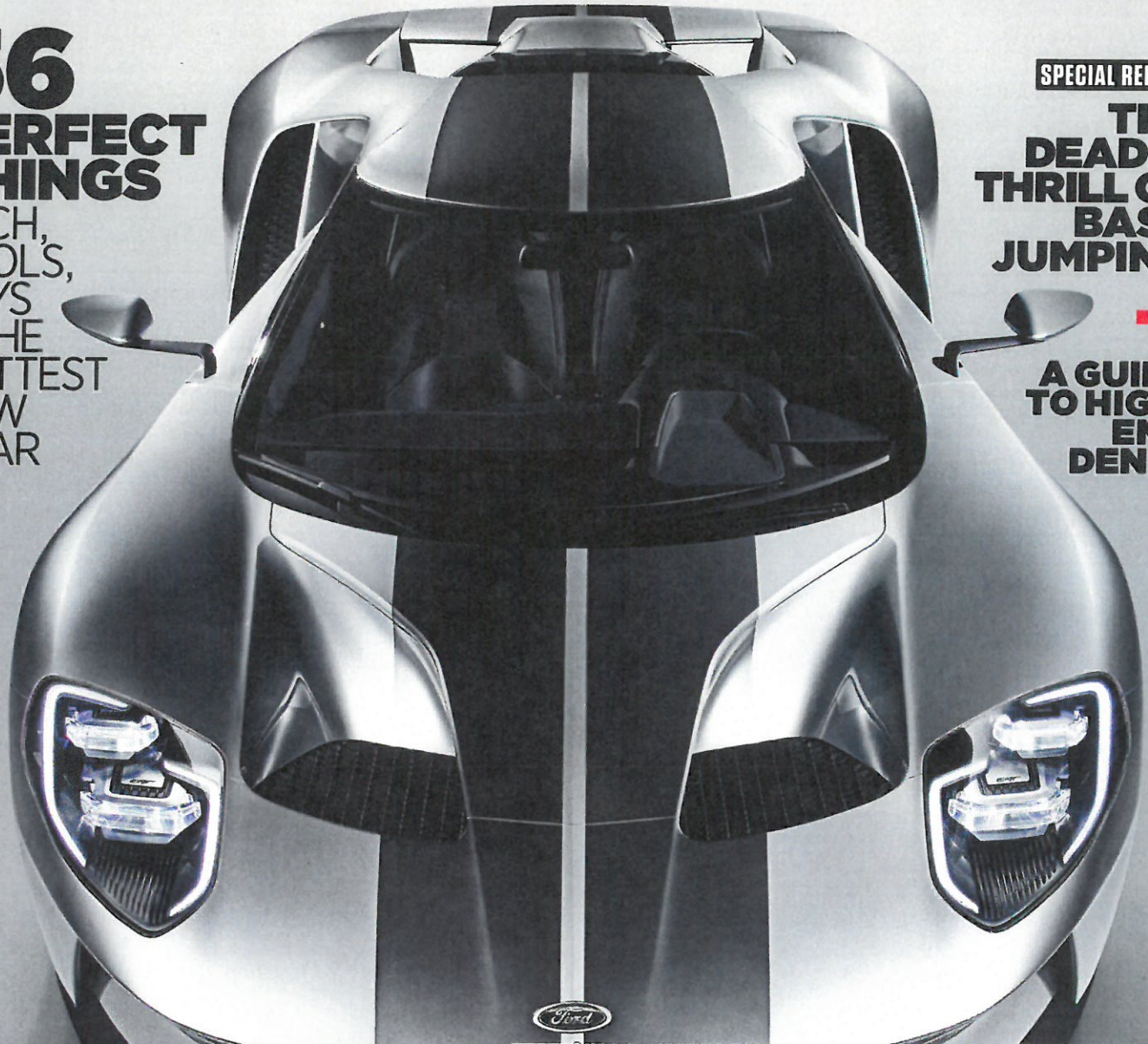
The Ford GT: An American-made supercar